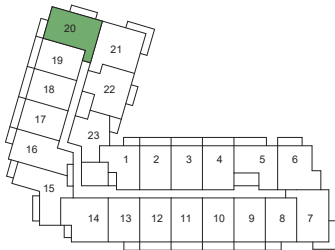
3RD & 4TH FLOOR

All prices, plans, drawings, dimensions, specifications and terms are subject to change without notice. Plans, drawings, dimensions and specifications are approximate. Available features and finishes may vary from suite to suite. Furniture is displayed for illustration purposes only and does not necessarily reflect the actual layout of the suite and the electrical plan for the suite. Suites are sold unfurnished. Actual usable floor space may vary from stated floor area and the Vendor shall not be liable for any resulting variances. E. & O.E.